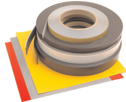
Adhesive backed magnetic sheet or tape can be supplied for an 'invisible' fixing.

magnetic sheet or tape for an 'invisible' fixing. This can easily be cut and applied to the back of any object that needs to hold onto the wall.