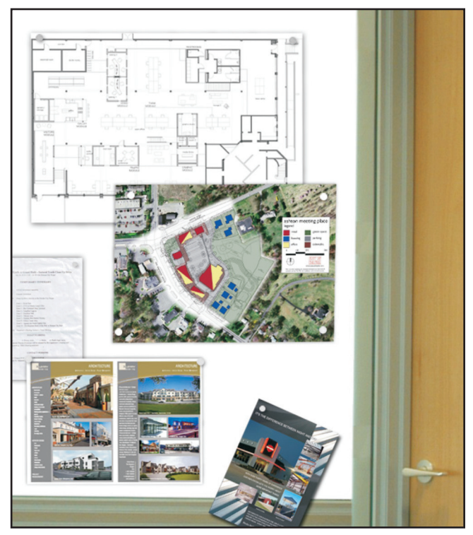
Part of an office wall covered with Magnetic Wallpaper